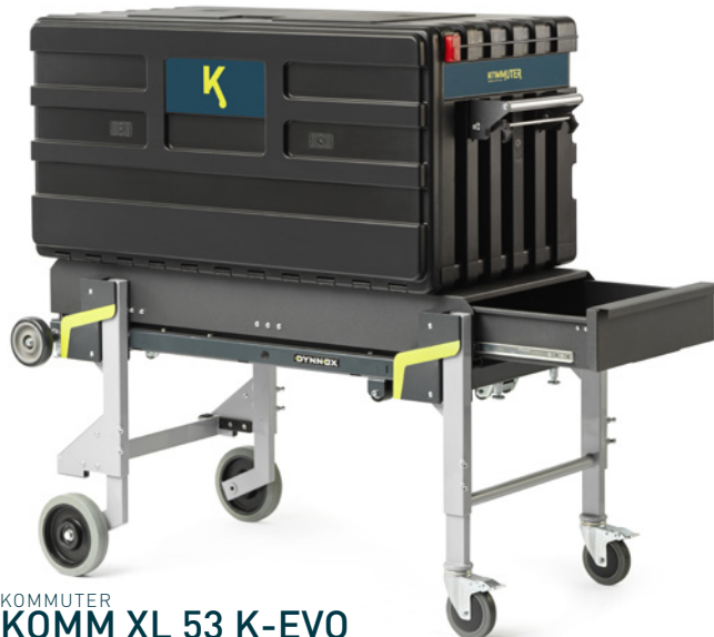
KOMMUTER KOMM XL 53 K-EVO