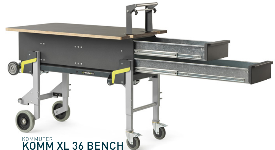
KOMMUTER KOMM XL 36 BENCH