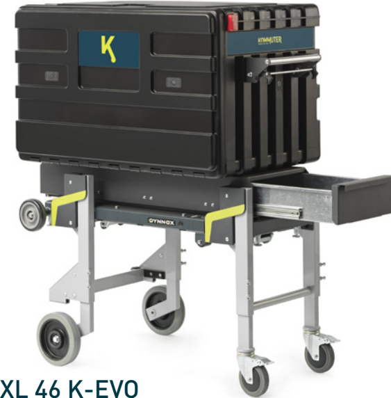
KOMMUTER KOMM XL 46 K-EVO