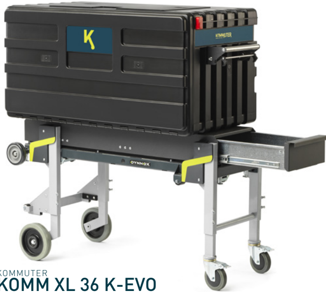
KOMMUTER KOMM XL 36 K-EVO